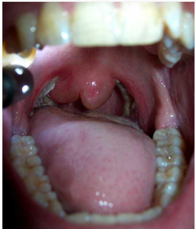
Swollen uvula is expected.