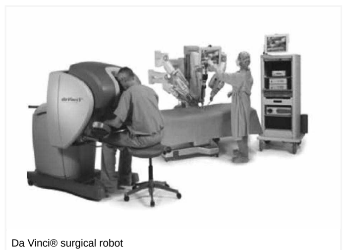
Da Vinci® surgical robot

Kent and Canterbury Hospital was the first hospital in the South East of England, outside of London, to offer this advanced treatment option.