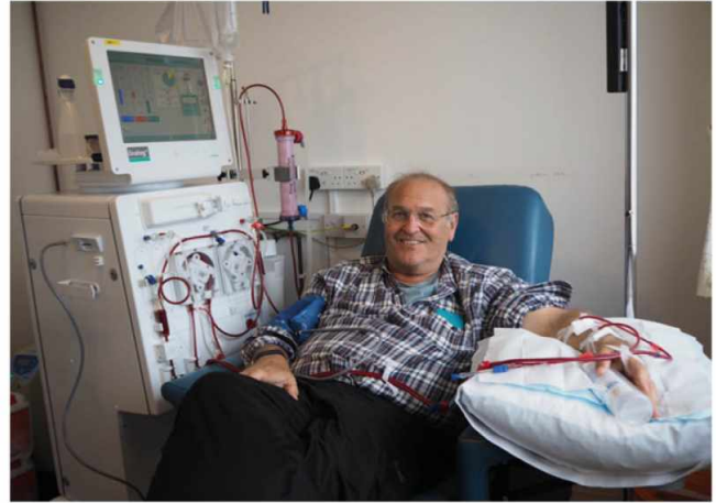
Patient having dialysis at the hospital