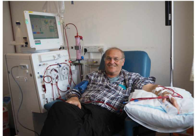
Patient having dialysis at the hospital