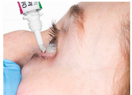
Using eye drops / ointment