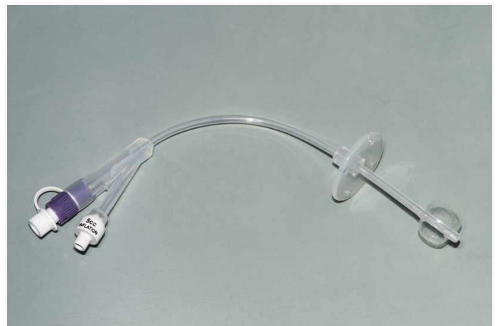
A Freka PEG tube

Once in the stomach a bright light will be shone showing the position of the stomach and the endoscope tip to find a suitable position to place the feeding tube.