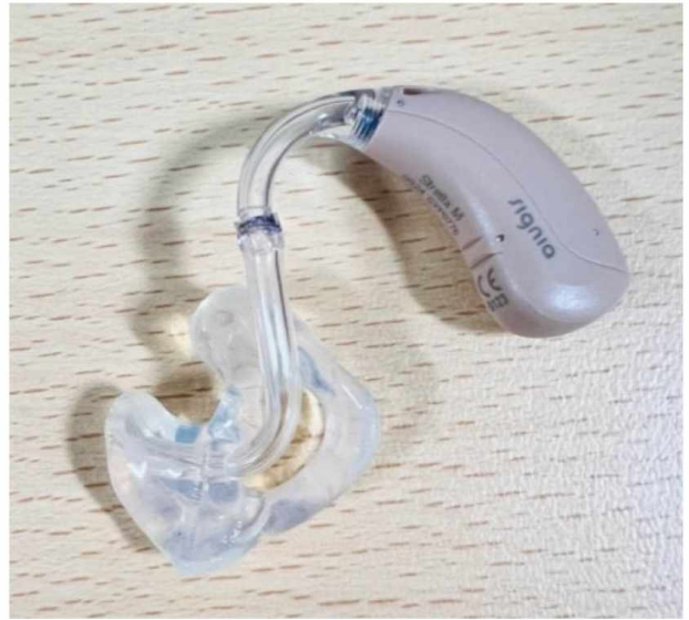
Step 5: Reattach your hearing aid.

If you have any problems or issues fitting your new ear mould, please contact the Audiology Department.