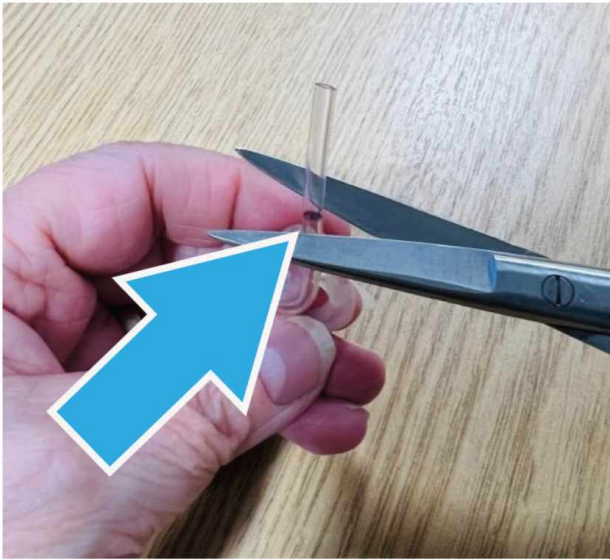
Step 4: Cut carefully at the marked cut-off point.