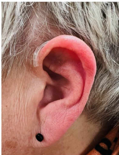
Step 1: Hang your hearing aid on your ear, as it normally sits.