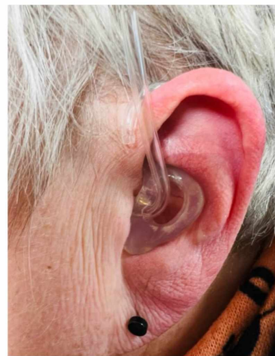
Step 2: Insert your new mould in your ear.