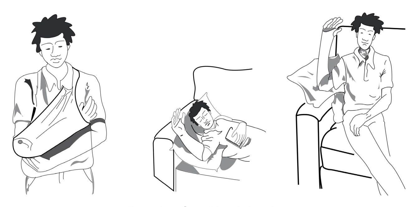
Examples of good hand elevation

After the first two days remove the outer bandage, leaving the sticky plaster in place for a further seven to 10 days.