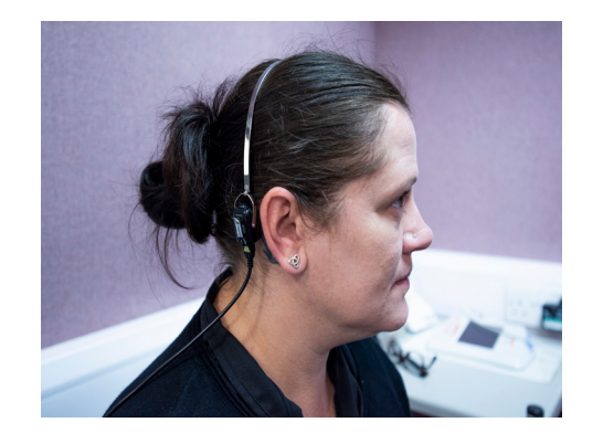
Patient wearing headband