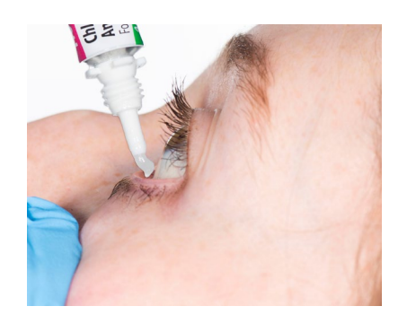
Using eye ointment