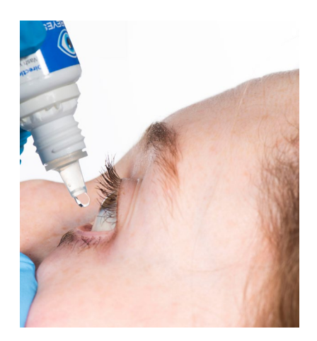
Using eye drops