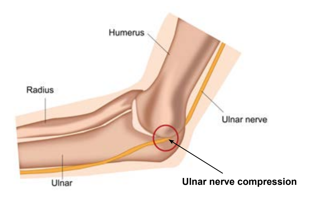
Diagram showing where the ulnar nerve can be compressed on the inside of the elbow

Cubital tunnel syndrome is when your ulnar nerve gets compressed (squeezed) or irritated within the tunnel found on the inside of your elbow (where your 'funny bone' is). This compression or irritation stops the nerve from working correctly.